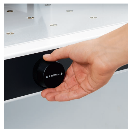
ELECTRONIC HAND WHEEL

The light beam safety curtain in the working area of this professional guillotines ensures the highest level of safety and cutting convenience.