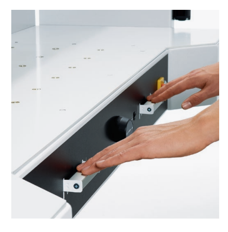
PATENTED EASY-CUT ACTIVATING BARS

Ideal for manual backgauge positioning, the electronic hand wheel has infinitely variable speed control from very slow to very fast.