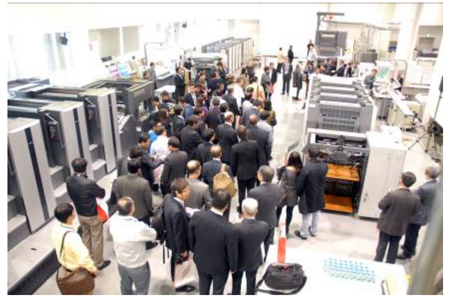
Guests tour the showroom with presses ranging from 1050 mm format to A2-size