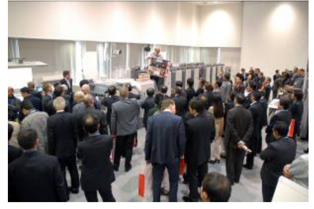
A demonstration of instant curing of LED-UV for double-sided printing and an introduction to the press's superior cost performance.

RYOBI 928P (with convertible perfecting device and LED-UV printing system)